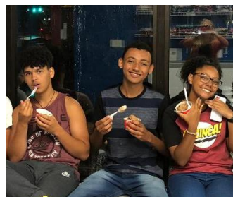
2019 BRAYCE Recruits