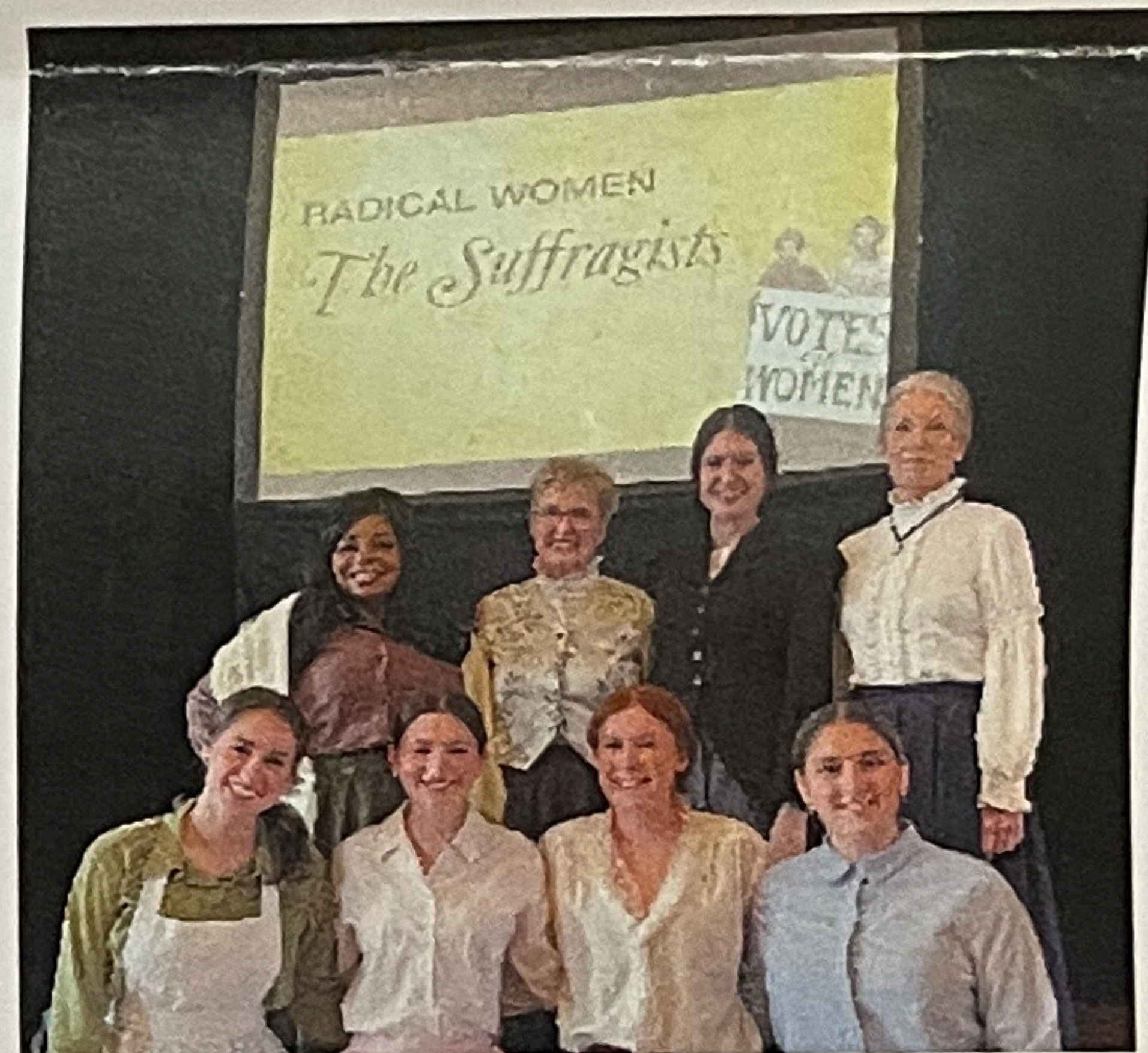
The Cast of Radical Women