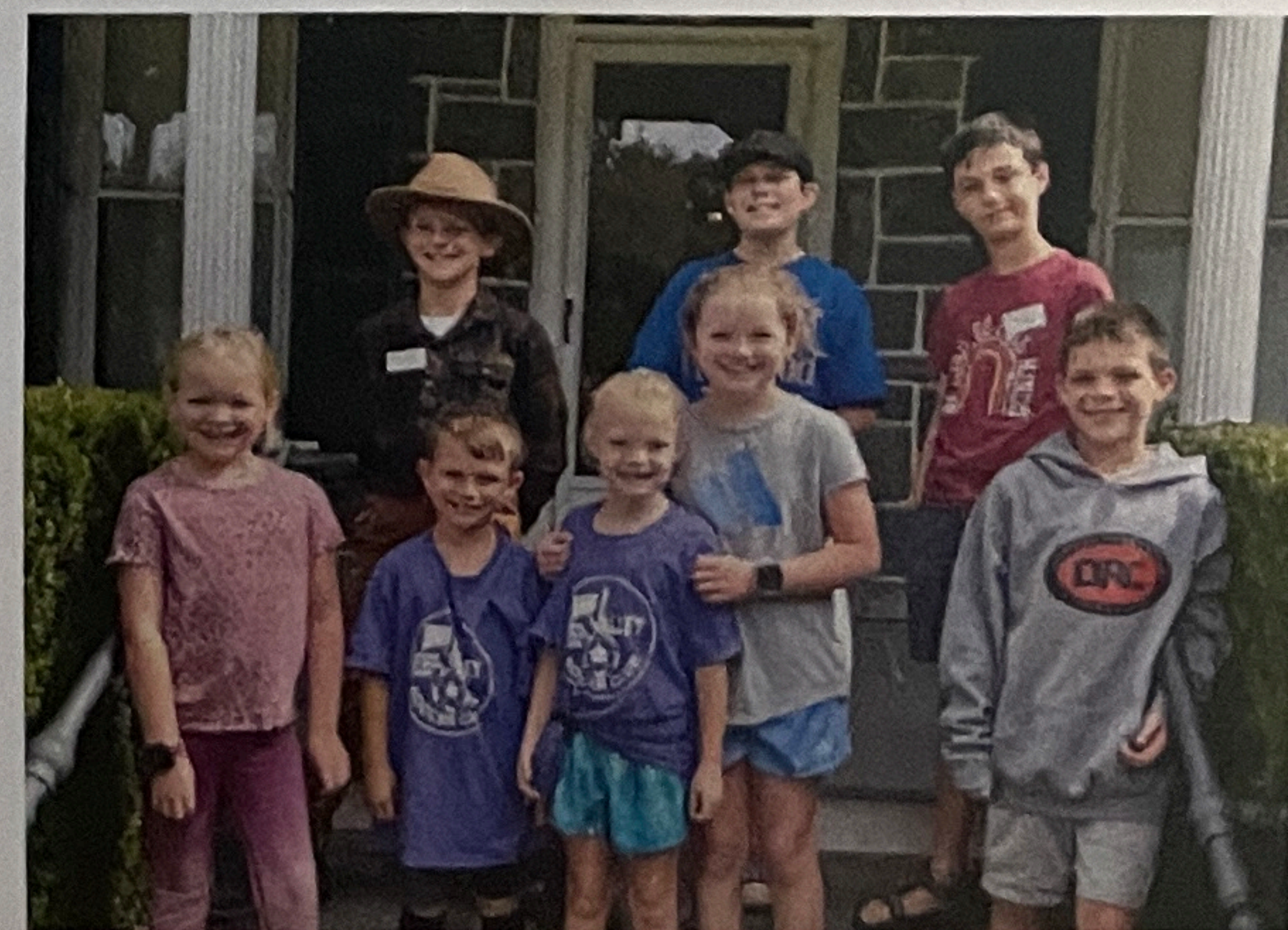
Junior docents guide other children at Farm Day