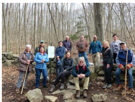
Woodja Hill Hike