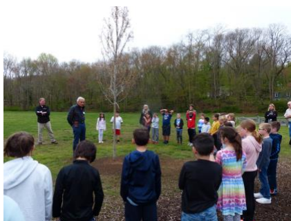
Arbor Day Planting at Essex Elementary

The land trust owns or has easements on 650 acres and helps to manage some of the Town of Essex’s open space as well. ELT is the largest landholder in the Town of Essex and is committed to promoting passive recreation for the enjoyment of the community.